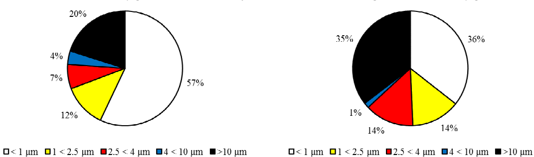
Fig. 1. Percentage of dust fractions in new cowshed A (left) and B (right)

The left part of Fig. 1 presents the graph of the size distribution of dust particles in the new modern cowshed A without straw bedding. The main parts of dust are the particles smaller than 1 \mu m (PM<sub>1</sub> = 57 %) and 20 % of total dust are the large particles bigger than 10 \mu m. The air contains also quite big percentage (12 %) of dust particles bigger than 1 \mu m and smaller than 2.5 \mu m. Particles between 2.5 \mu m and 10 \mu m create the rest of dust pollution. The right part of Fig. 1 presents the graph of the size distribution of dust particles in outside air in the old cowshed B with straw bedding. Dust fractions are rather uniformly distributed between the smallest particles (PM<sub>1</sub> = 36 %), the biggest particles (35 % particles bigger than 10 \mu m) and the rest (29 %) are particles bigger than 1 \mu m and smaller than 10 \mu m. The left part of Fig. 2 presents the graph of the size distribution of dust particles state. Dust contains main part (49 %) of dust the particles smaller than 10 \mu m. There are 10 % of particles bigger than 1 \mu m and smaller than 2.5 \mu m and 10 \mu m.